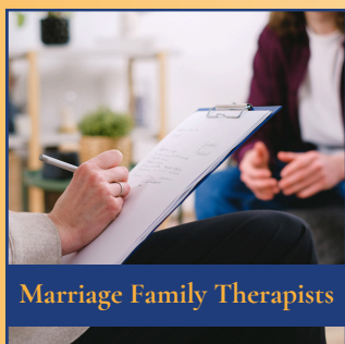
Marriage Family Therapists