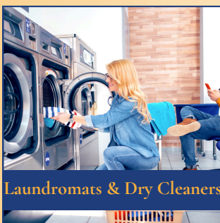
Laundromats & Dry Cleaners