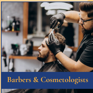
Barbers & Cosmetologists