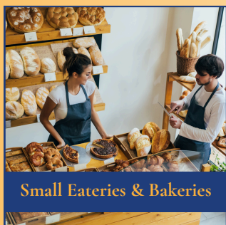
Small Eateries & Bakeries