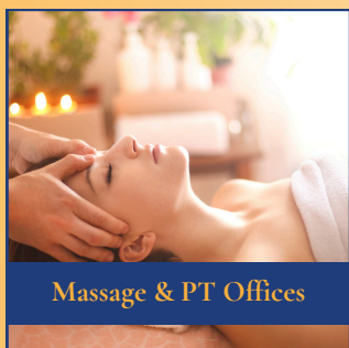
Massage & PT Offices